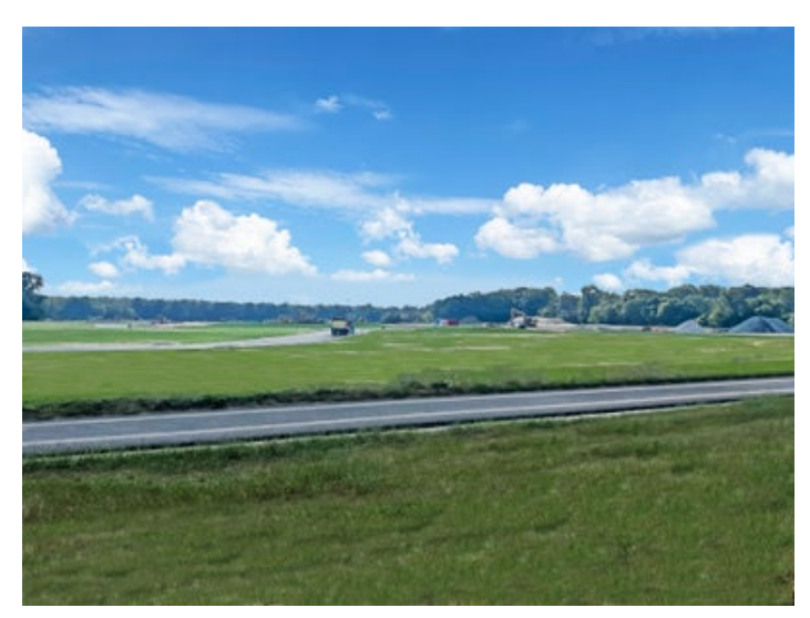
From Route 1: Take Barratts Chapel Rd (Rt 317) West for 1 mile, the community is on the left.

Rural Living Just Minutes from the Hustle and Bustle of Route 1!