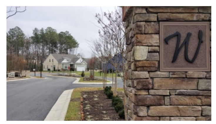
From Route 1: Take Route 9/DE 404 West. Follow 4.6 miles. Make a left on Cool Springs Road. Drive 4 miles to Woodridge on your left.